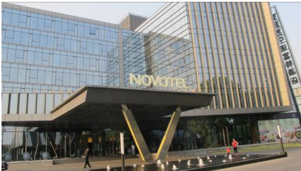
Novotel Nanjing East Suning Hotel

The 7 th meeting noted that the membership of the TC now stands at 32 P-members (increase of 3), 15 O-members (decrease of 1) and 31 Liaisons (increase of 2).