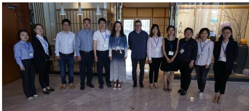
Members of the Support Team (Photo 2)