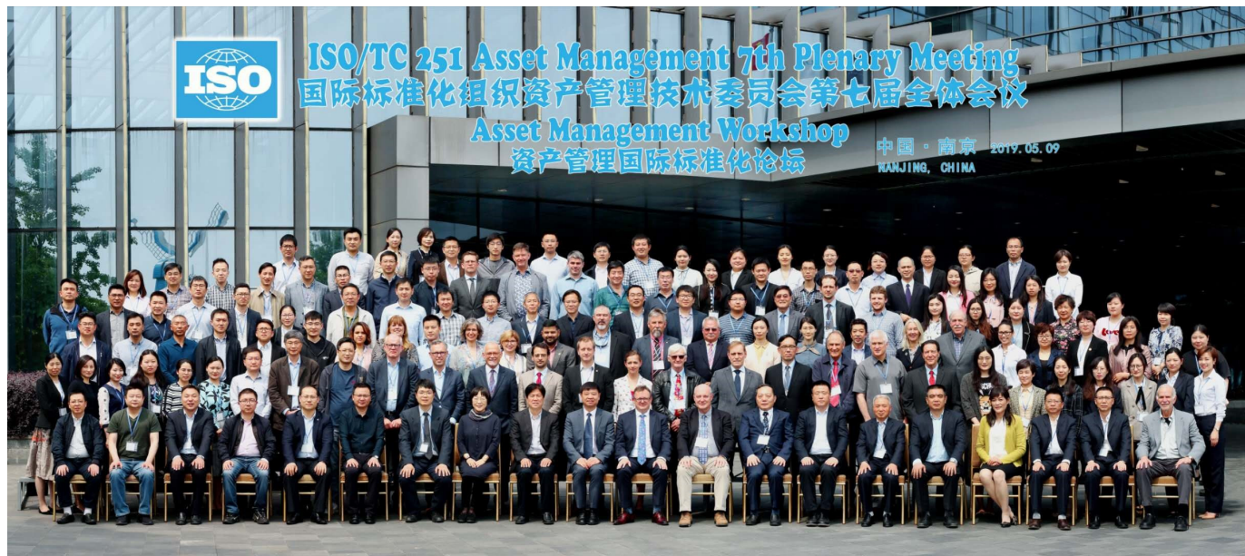
Delegates to the workshop