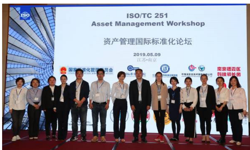
Members of the Support Team (Photo 1)

Specific thanks are owed to all the members of the meeting support team for their exceptional efforts in planning, organizing and assisting the meeting.