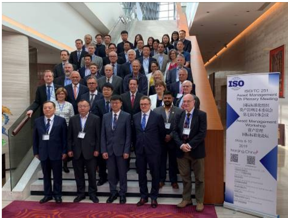
Delegates to the meeting